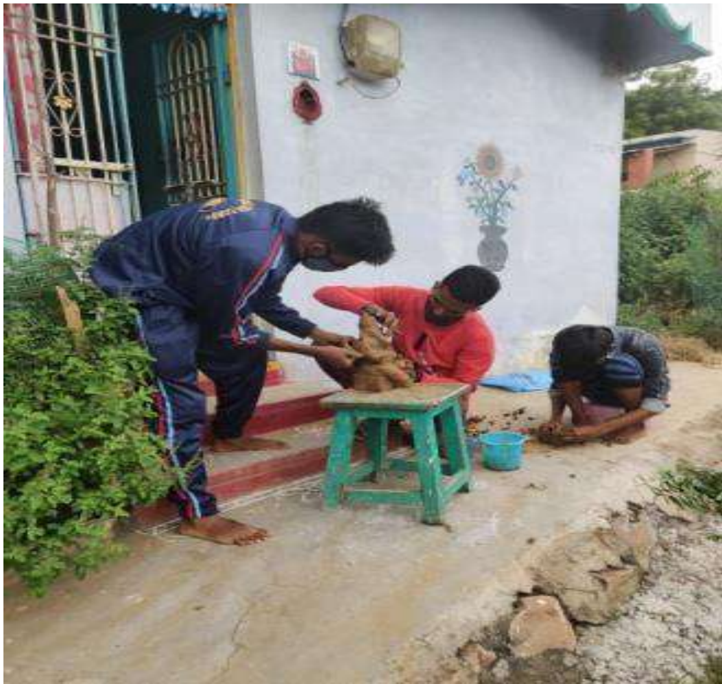
Our students involved in making Ganapati