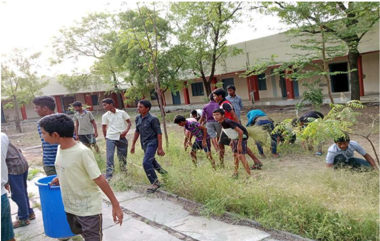
Swachh Bharath Program