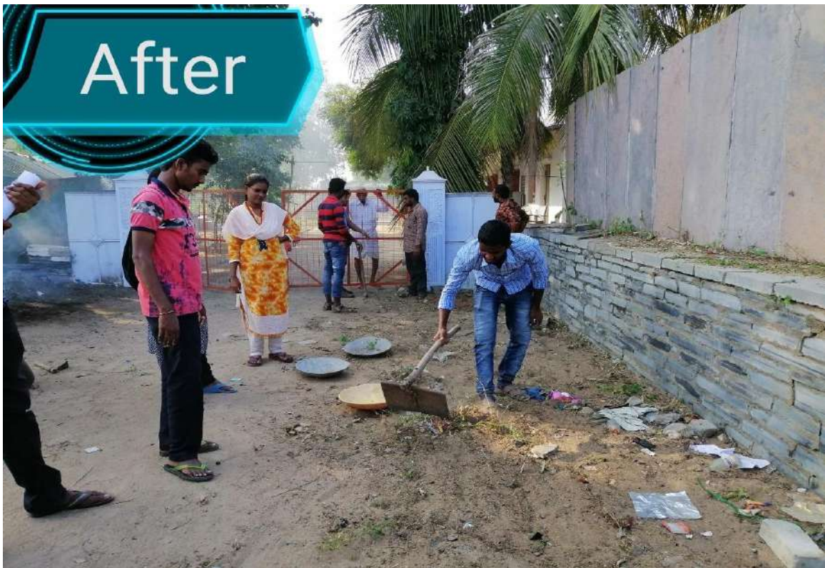
Clean and Green Program