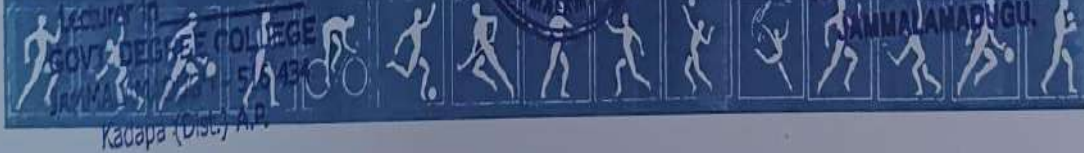
Merit Certificate at College Level in view of College Day Celebrations for 2017-18

[Signature] Principal GOVERNMENT DEGREE COLLEGE JAMMALAMADUGU.