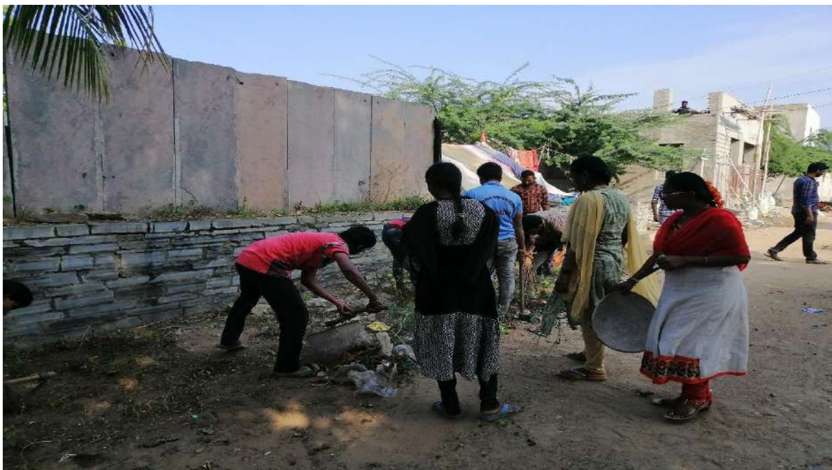
Students participating in clean and green program