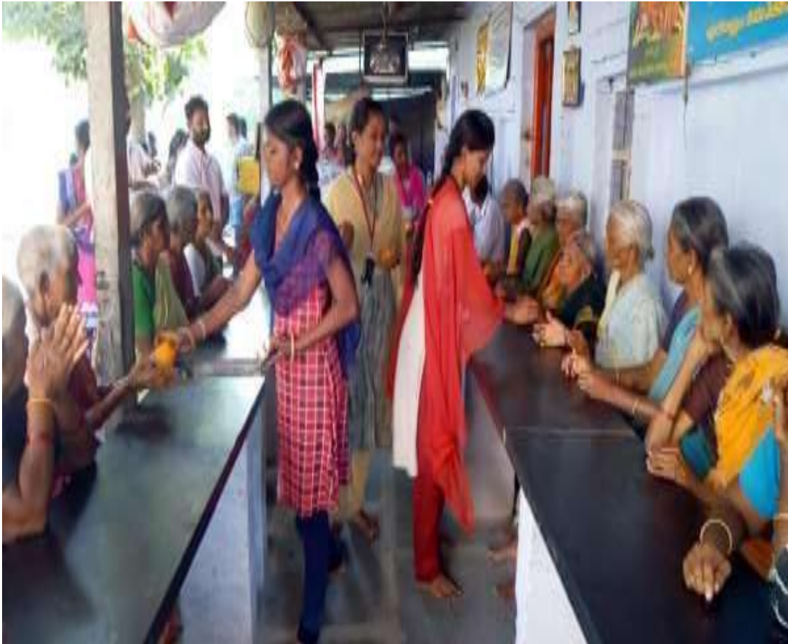
Distribution of fruits in the old age home at Proddatur by our students