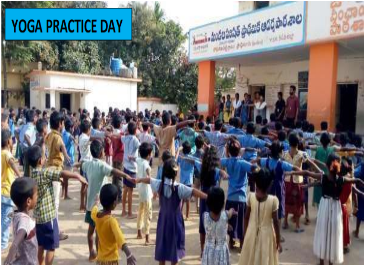
Awareness program on Yoga and Meditation