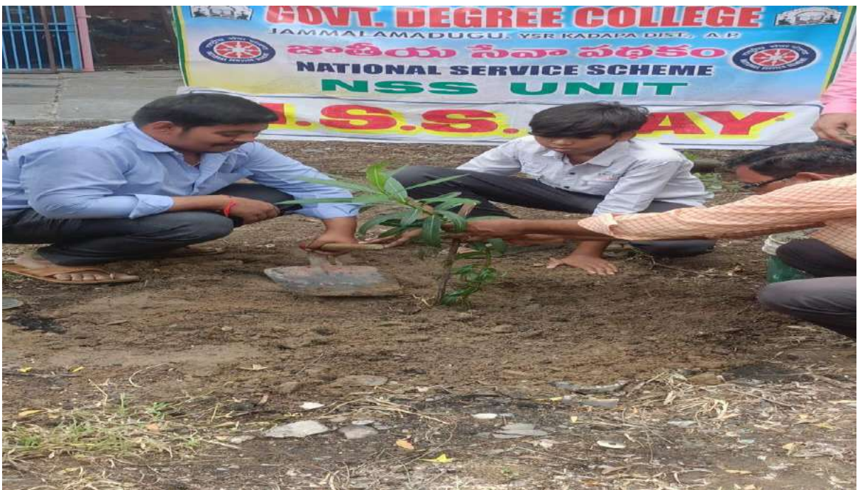
Plantation on NSS Day