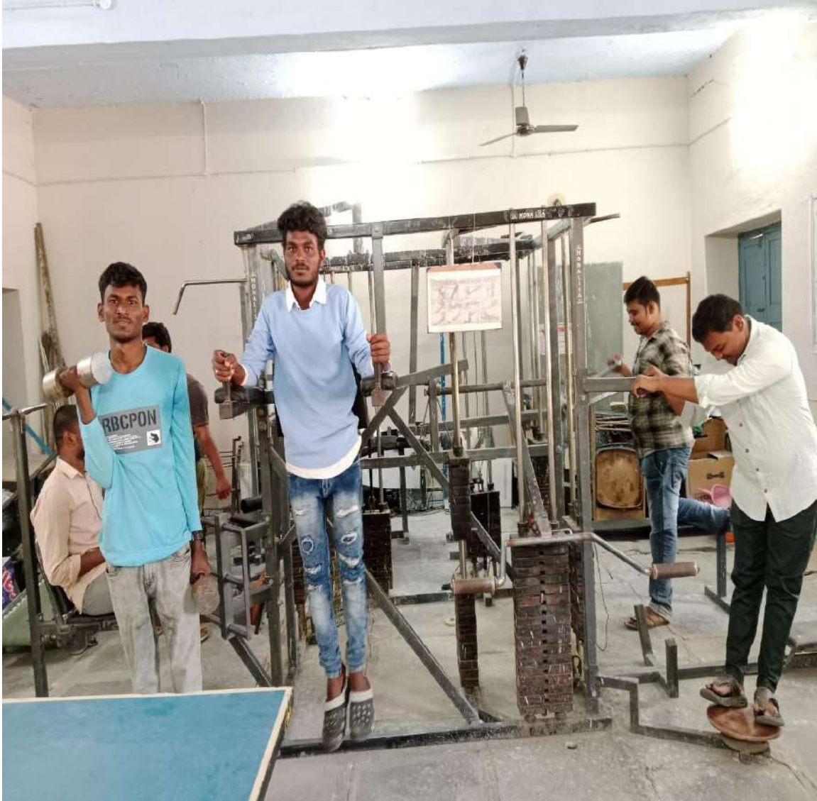
Student workouts in college Gymnasium