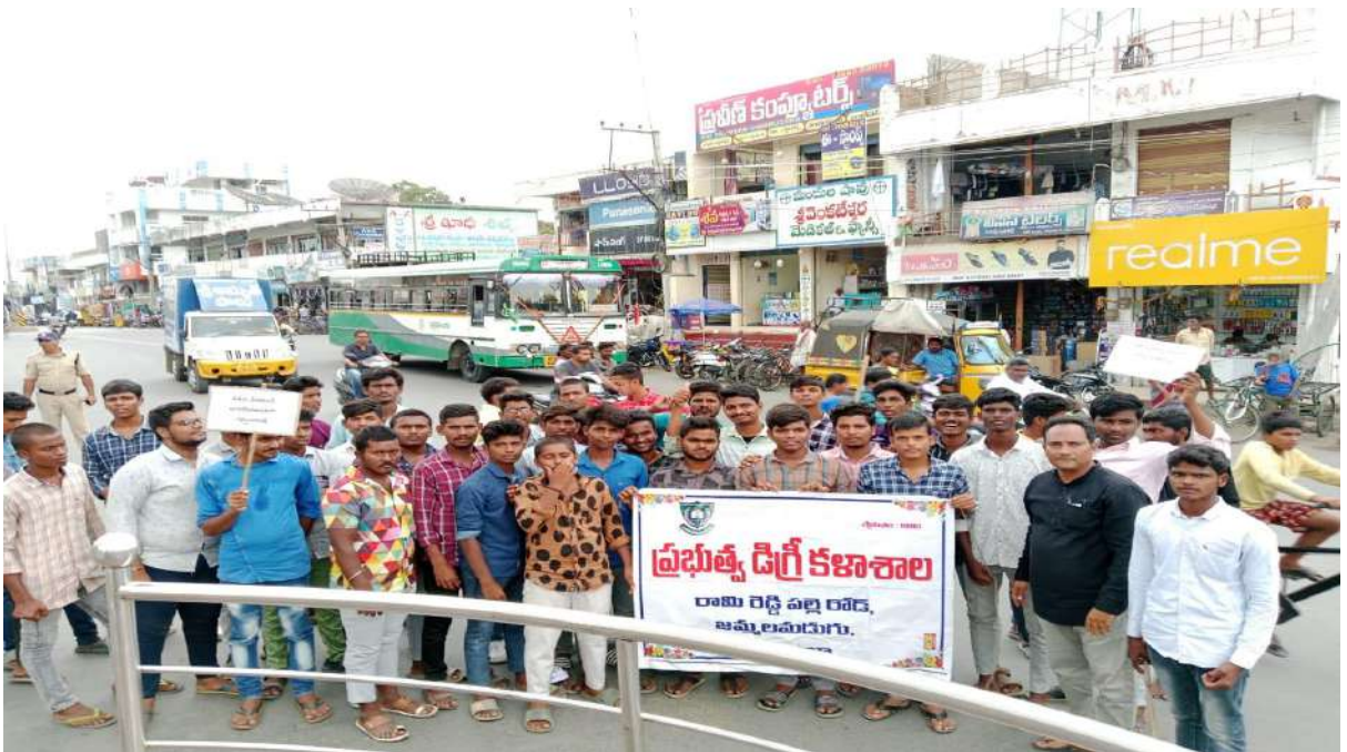
Awareness Rally for AP General Elections