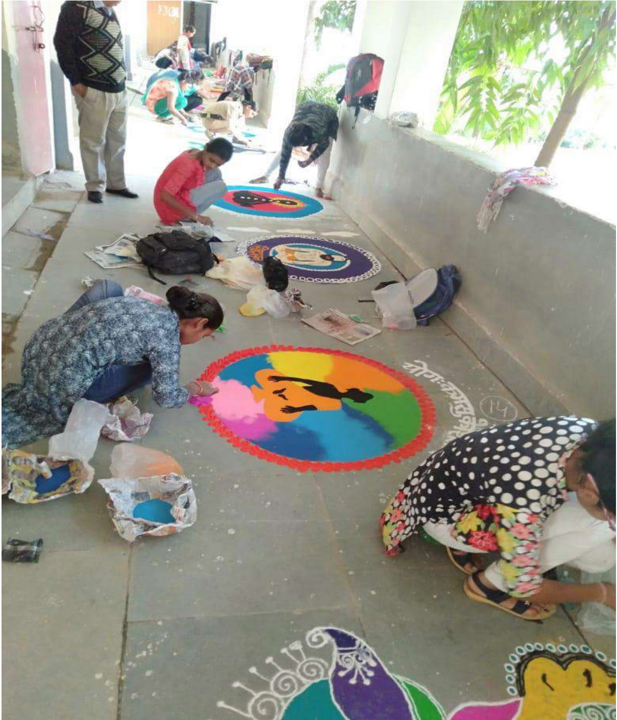
Students participating in the Rangoli competitions