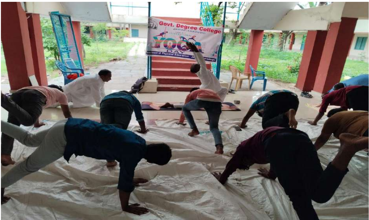
Students and Staff participating in Yoga Day Celebrations