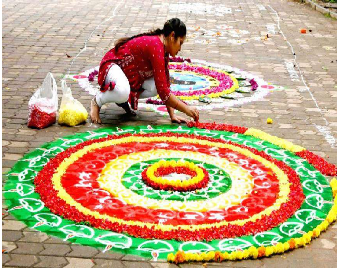
Our student participating in Rangoli competition