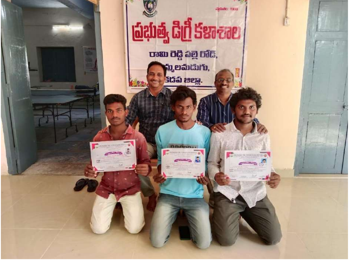
Shooting Ball Certificates