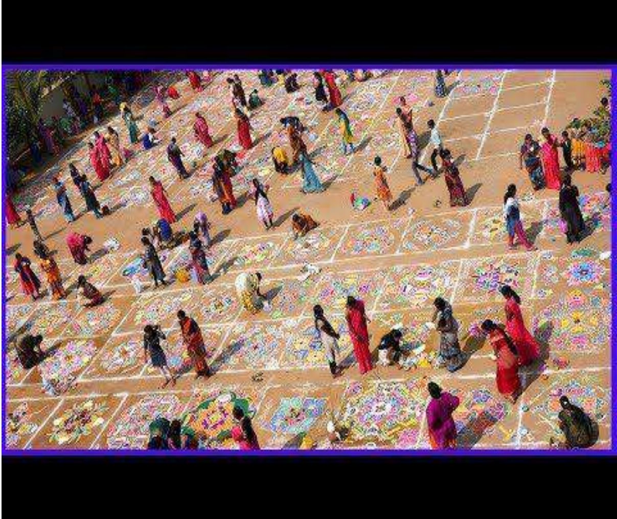
Our students participating in Rangoli competitions