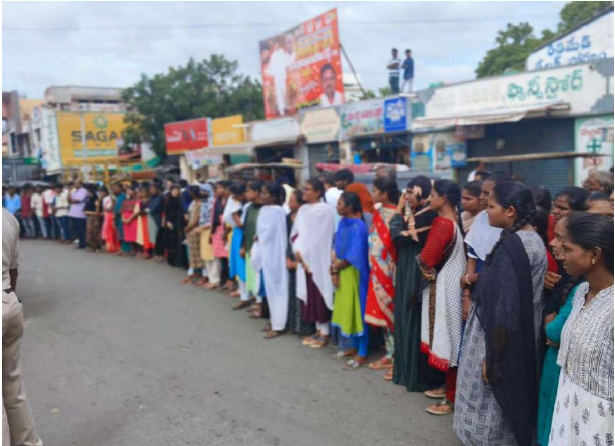
Women empowerment Rally in Jammalamadugu