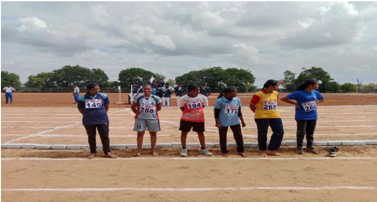
Students participating in 800 meters running at Y.V. University, Kadapa