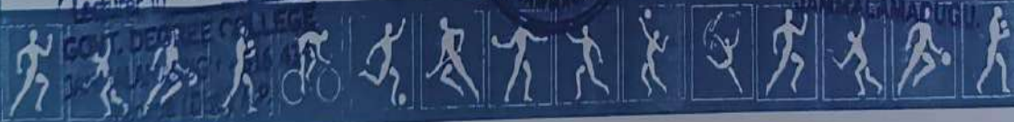
Merit Certificate at College Level in view of College Day Celebrations for 2017-18

[Signature] PRINCIPAL GOVERNMENT DEGREE COLLEGE JAMMALAMADUGU.