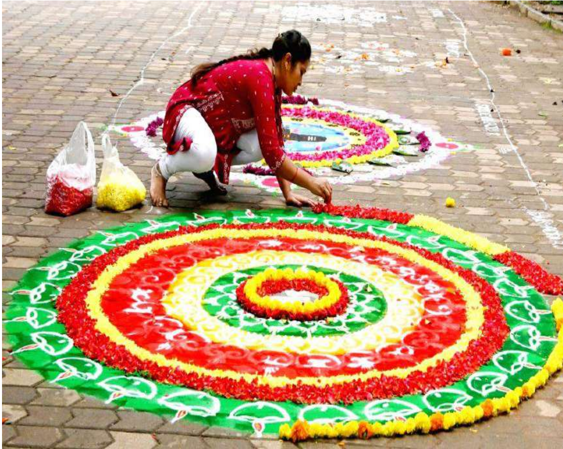
Our student participating in Rangoli competition