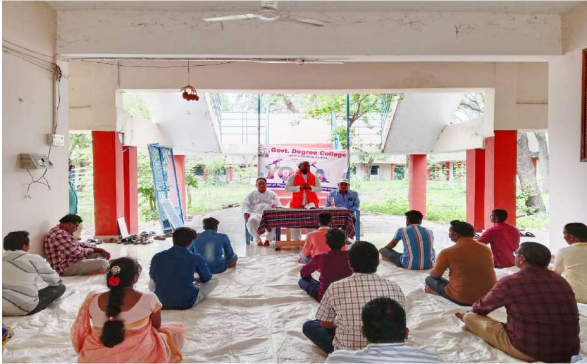
Students and staff participating in Yoga Day